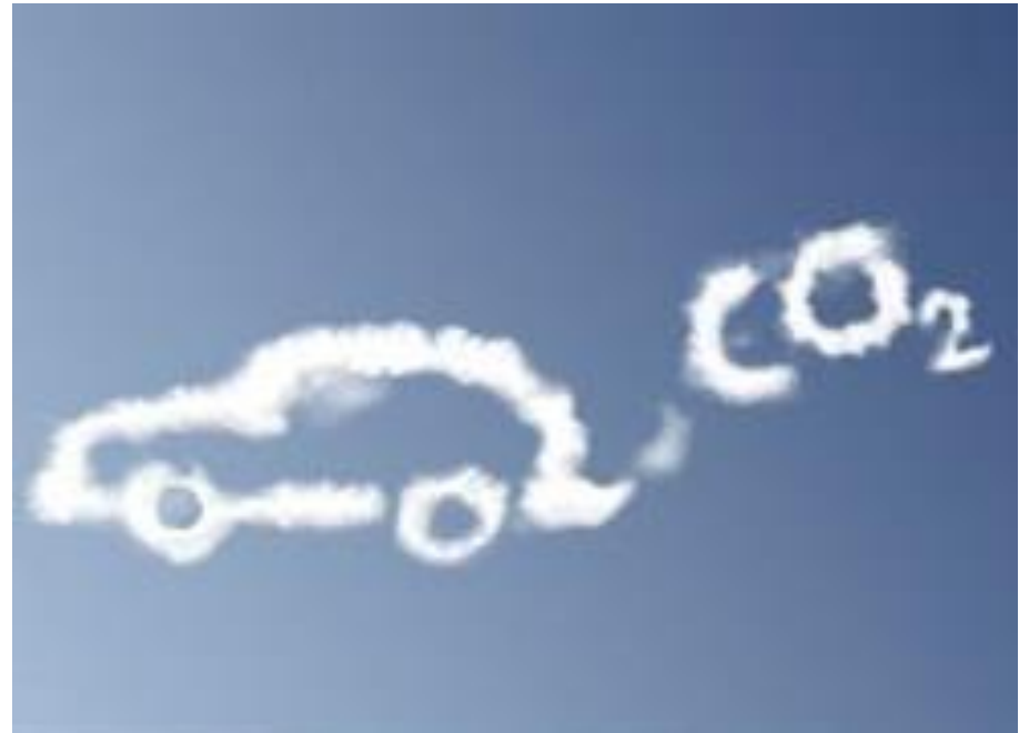
CO 2 emissions from light-duty vehicles